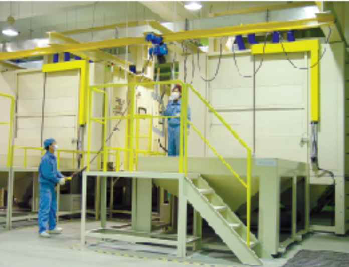
大型自动喷砂机 | Large sized Auto blasting equipment

Gravitation, direct pressure blaster will provide skin and film stripping and final task.