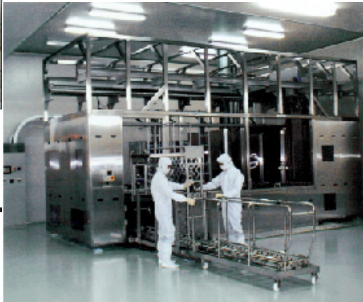
3槽式洗净机 | 3-Tubs cleaner

3-Tubs cleaning super pure water cleaning like 7 tubs cleaning is fitted in class 1000 clear room to provide final cleaning.