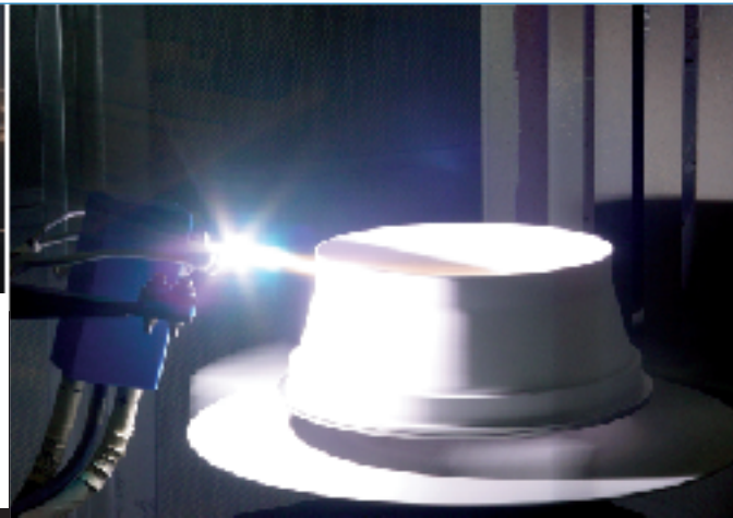
Plasma 溶射机 | Plasma spray