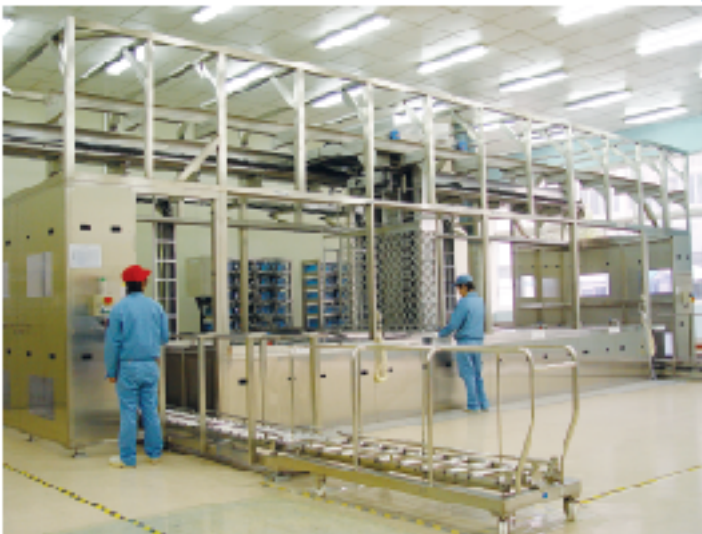
7槽式洗净机 | 7-Tubs cleaner