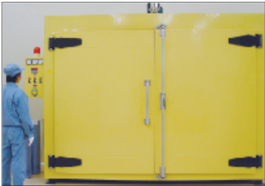
大型烘干机 | Large sized oven