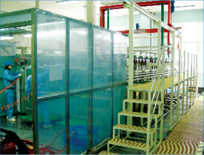
大型半自动液洗机 | Large sized Semi-auto cleaning tank

Acceptance List the cleaning parts in order to compare with the existing one.