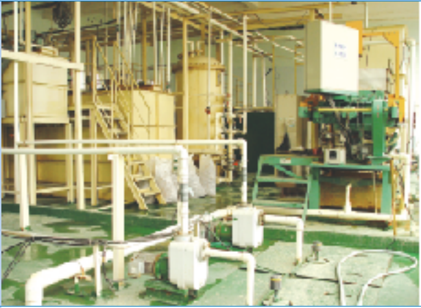
废水处理设备 | Waste treatment