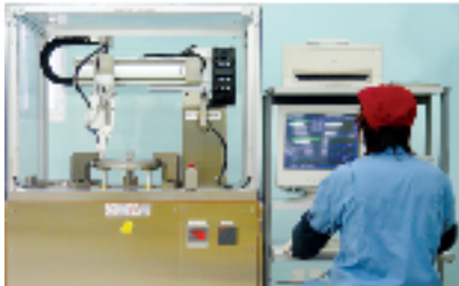
Ring Chuck 检查机 | Ring Chuck check machine

Provided with ring chuck full auto checking machine to check every product.