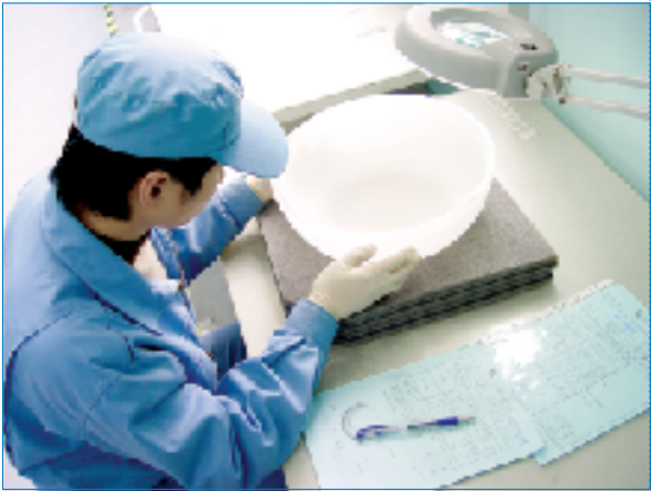
受入检查 | Acceptance check