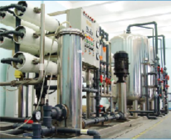
纯水设备 | Pure water equipment