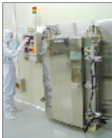
真空烘干机 | Vacuum oven

⑥ 三槽洗净 和七槽同样的三槽超纯水洗净设备在1000级净空房内 进行最后洗净。