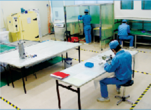
泵处理 | Surface partices testing