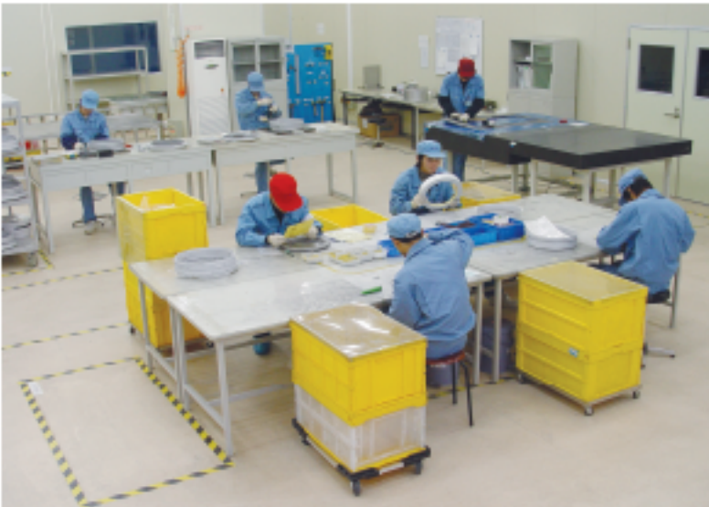
中间检查室 | Mid-check room