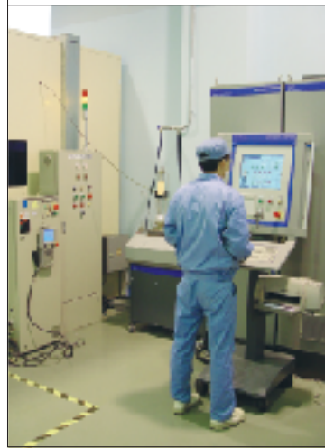
溶射室 | Spray room

Adopting plasma spray and ARC spray machine to meet with the requirements of customers.