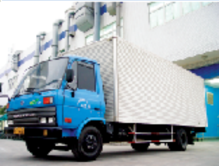
洗净事业出货厢 | Delivery compartment after cleaning

Quick and careful delivery to customers.