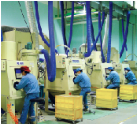
喷砂线 | Blast line