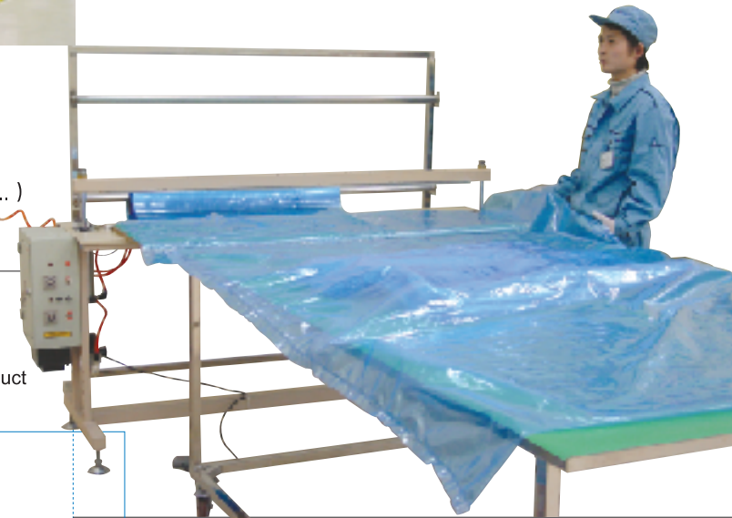
大型封口机 | Large sized sealing equipment

With the latest super huge auto machine with 7 tubs cleaning machine (by way of a chamfer tank) to conduct supersonic cleaning.