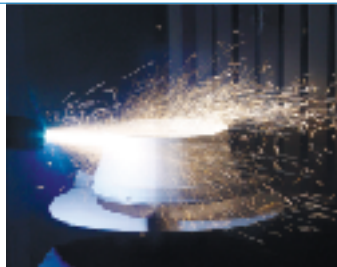
电弧溶射机 | ARC spray